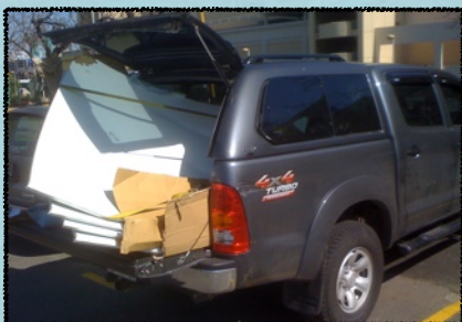
Hauling all the new Radio & TV equipment in our Speed-The-Light truck was a snap thanks to the Youth of Ohio! Thanks for investing in us and Argentina!