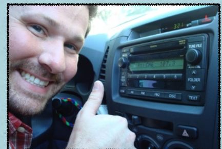
Sounds Good! The first day we began transmitting "Radio Vida" 107.3 FM San Isidro, Buenos Aires, Argentina - November 12, 2010