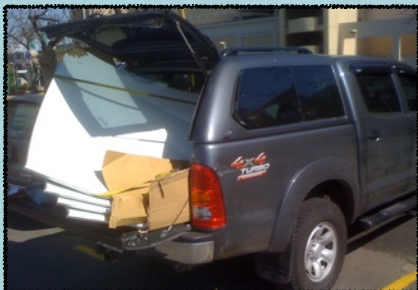
Hauling all the new Radio & TV equipment in our Speed-The-Light truck was a snap thanks to the Youth of Ohio! Thanks for investing in us and Argentina!